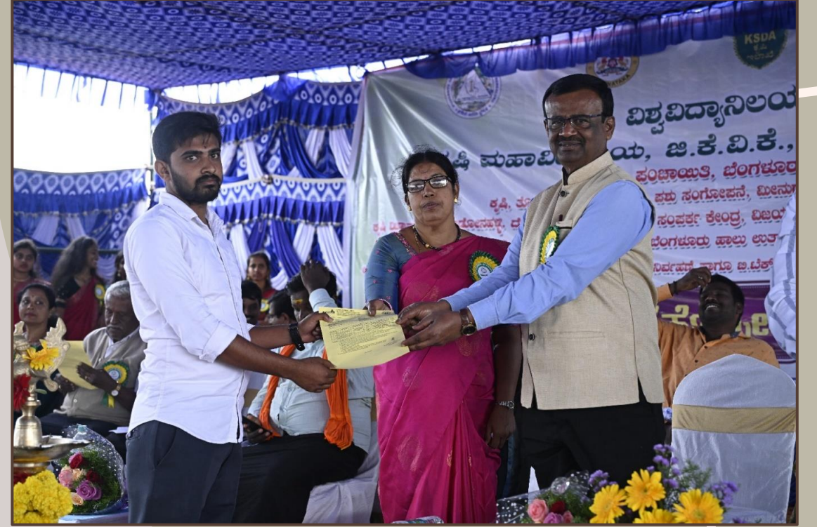
Distribution of Soil Health Card to farmers.